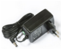
24V 1.2A power adapter